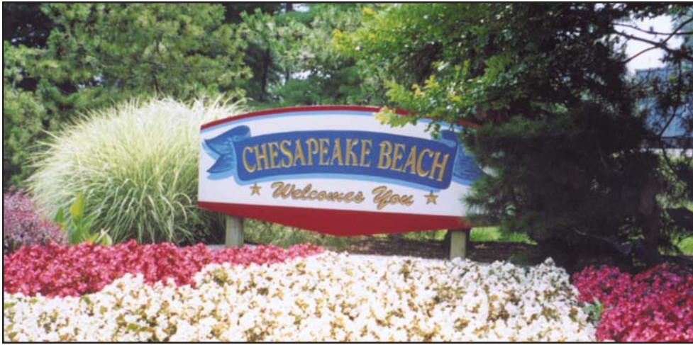
Welcome Signs and Landscaping