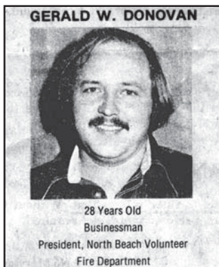
Then: First Campaign