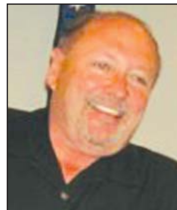
Now: Retirement Announcement

I realized the other day that I have been directly involved in Town politics more than half my life, and indirectly involved my entire life. My grandfather had been Mayor in the 1950's and 1960's, my father had succeeded him and my mother had been the Town Clerk for many years. In my home, the third Thursday of the month has always meant town meeting night.