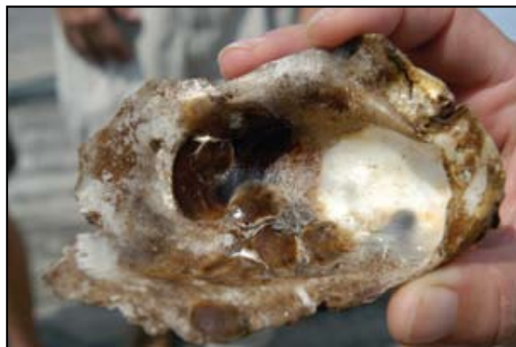
Newly attached oyster spat on an old shell. These spat will mature to be the size of a quarter in the year that the oysters remain in the cages.