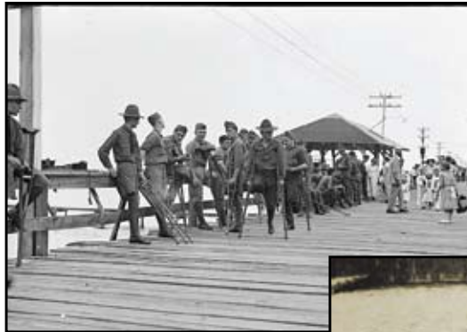
1919

The entire town turned out on Saturday, August 14th to send-off a group of Wounded Warriors on a fishing trip on the Chesapeake for the fourth year in a row! Amid a stream of red, white and blue, an arch of American flags and a helicopter fly-over, the bus and other vehicles carrying our wounded warriors made its way to the Rod 'N' Reel dock. Just like Chesapeake Beach did in 1919 and again in the 1940s (see photos), we once again provided a weekend away for these great men and women who have fought on our behalf to keep us safe here at home. After fishing on the Bay, the American Legion provided a family barbecue, dance and entertainment. The soldiers then spent the night at the beach and after a hearty breakfast at the Rod 'N' Reel on Sunday morning, the Beach Trolley was waiting to take them to North Beach for more fishing! Our Town was proud to provide some time away from the hospital for these soldiers and their families. The soldiers said they had never received such a great welcome. We look forward to seeing them back again next year!