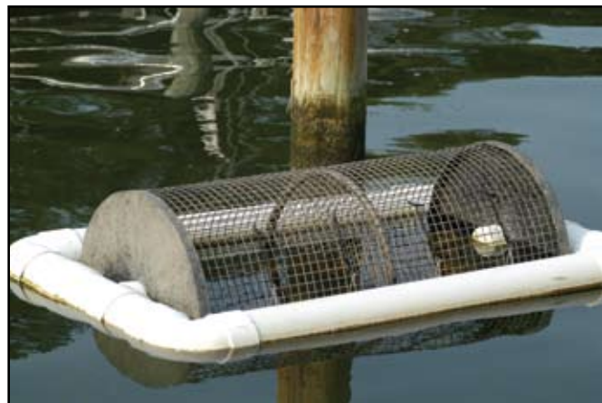
An oyster cultivation cage, such as might be placed under the Chesapeake Beach Railway Trail timber walkway in Fishing Creek.

While on a recent town tour with Les King, our landscaping contractor, we were at the entrance sign at Rt. 260 and Cox Road, discussing the landscaping and the general appearance of the south side of the road. As we sat there in my car looking