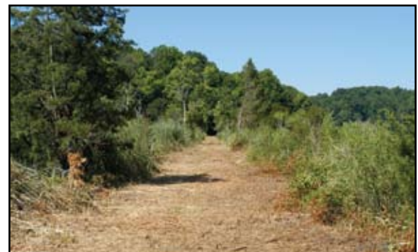
The original Chesapeake Beach Railway right-of-way looking west. This portion of the trail is across Fishing Creek from Bayview Hills.