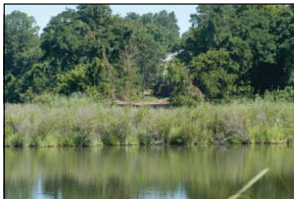
The view from the old right-of-way across the creek to Bayview Hills. This "spur" will also continue across the marsh to Richfield Station.