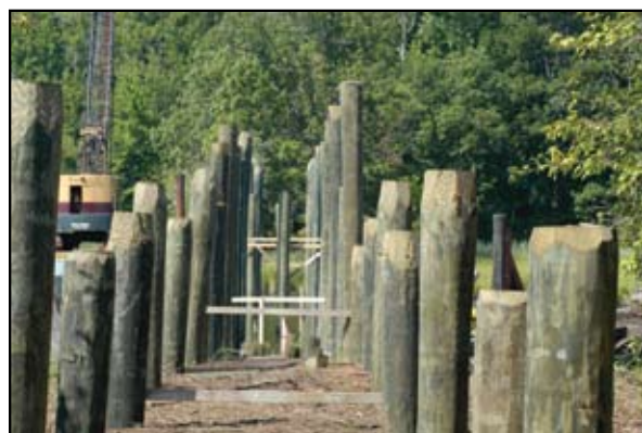
The pilings for the bridge across Fishing Creek at the old railway trestle site.