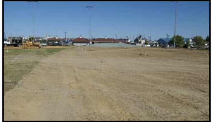
Kellam's field as the grading process began in early July. The topsoil has been removed and piled up at either end of the field for later use. The stakes show the new height of the playing surface.

A little bit of history: In the mid 1980s, a football/baseball playing field was constructed on property purchased from Linwood T. Kellam. In the early 1990s the Town of Chesapeake Beach purchased the entire former Kellam's Marina. The property had previously been designated for a housing development and a marina; however, upon acquisition by the Town, the land was subdivided differently to accommodate the Northeast Community Center, the Chesapeake Beach Water