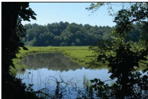
A view from the old right-of-way looking south across the marsh toward Old Bayside Road.

These trail photographs depict little seen areas that will soon be readily accessible to visitors to the Chesapeake Beach Railway Trail. Following these trail photos are three photographs taken on the SMOCS outing to plant the yearling oysters. The SMOCS photos were taken at the "Jonny Oyster Seed" operation at Battle Creek in the Patuxent River."