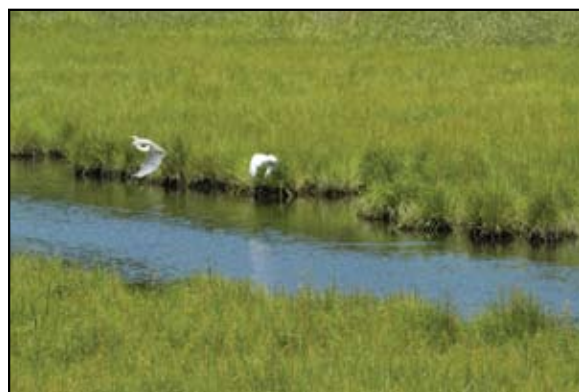
A pair of Egrets take flight in Paw-Paw Gut.