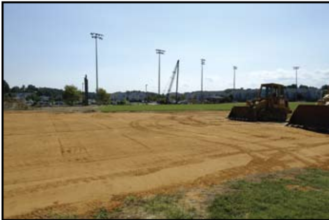
The new infield surface of the 70 foot baseball diamond. This field is typically used for smaller children with machine pitched and coach pitched games.