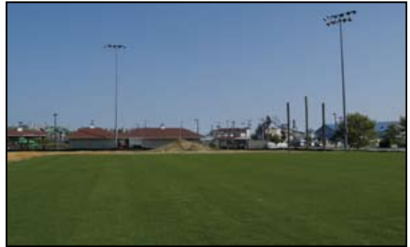
The football field with the new Bermuda grass playing surface in late August. The tall poles in the right background are pilings driven to support the new large scoreboard.

The Chesapeake Beach Railway Trail (CBRT) project is well underway, with all of the clearing of the right-of-way complete. The pilings for the two bridges across Fishing Creek and the timber walkways in the creek and across the wetlands are being driven