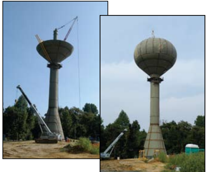
The Chesapeake Village Water Tower stem is up. When completed, this water tower will contain 350,000 gallons of water pumped from a well right at its base, and will feed it via gravity to rate payers.