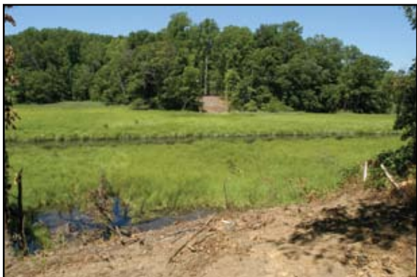
The view from the Bayview Hills spur across Paw-Paw Gut to Richfield Station.