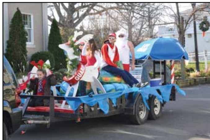
The Chesapeake Beach Water Park's entry in the Holiday Parade.

Swim Lessons – You can also sign up for swim lessons on the website for the 2012 Season. We have four sessions available and each session has five different levels. You can start your babies as early as six months with the new program – Mommy and Me/Daddy and Me – that was launched in 2011. This level is designed to give babies and young children a head start on swimming. The children get comfortable in the water and begin to work on basic skills while interacting with the instructor and other children in a fun and safe environment. A parent (or adult) must accompany the child in the water. Visit our website for more information on swim lesson levels and the dates they are offered. Space is limited and the first two sessions always fill up quickly. Discounts are available for