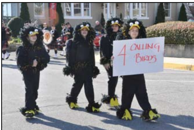
Crow Entertainment's entry in the Parade was 4 Calling Birds...and of course they look like "crows"!