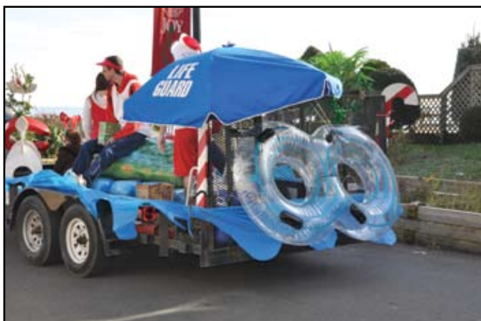
Some of the Water Park employees enjoy the beautiful day at the Holiday Parade.