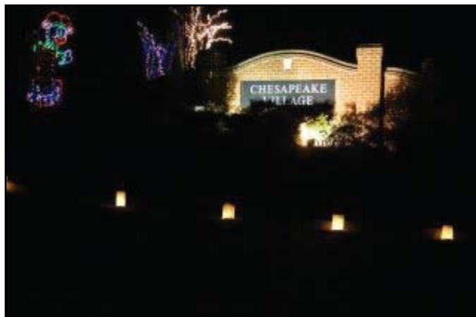
The entrance to Chesapeake Village on the evening of their Luminaries!

for all to drive through and enjoy the magic of the lights. In the spirit of the season, residents asked that visitors drop off a can of food or other non-perishable food items to benefit End Hunger in Calvert County. We hope this wonderful new tradition continues for years to come!