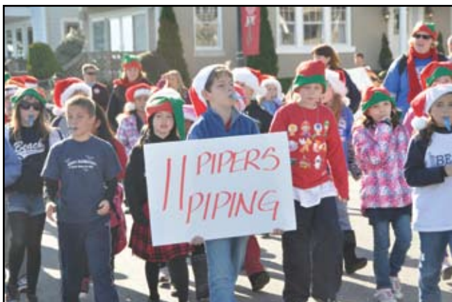
The Students from Beach Elementary played kazoos for their entry...11 Pipers Piping.