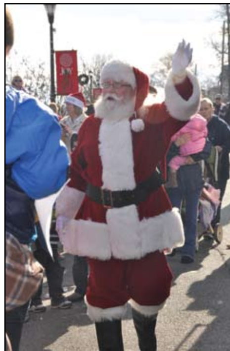
Santa Claus arriving for "Santa on the Beach" following the Holiday Parade.