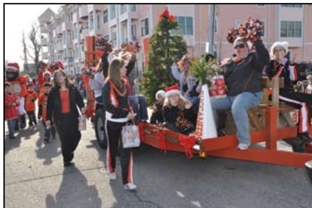
The Beach Buccaneers Float in the Holiday Parade.