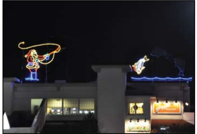
First Place for Business in the lighting contest went to the Rod 'N' Reel.