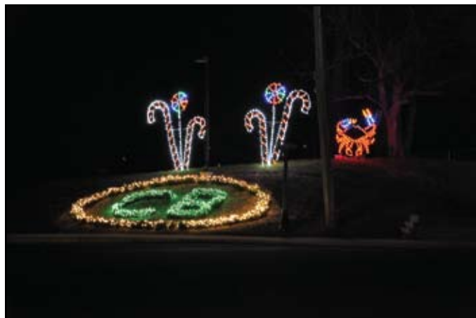
The CB Sign, along with the famous waving crab, welcomed visitors and residents to town!