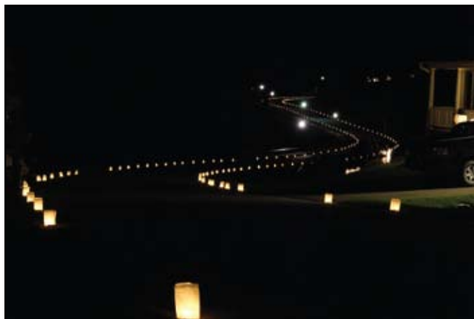
Chesapeake Village Luminaries.

A new tradition continued this year with the Chesapeake Village Luminaries on December 17th. The entire Chesapeake Village community participated in this beautiful display! This year, nearly 2,000 luminaries were placed along the roadsides throughout the community. This beautiful spectacle was free