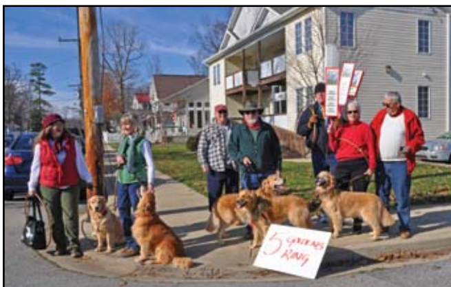
The Chesapeake Beach Garden Club's entry...5 Golden Rings.