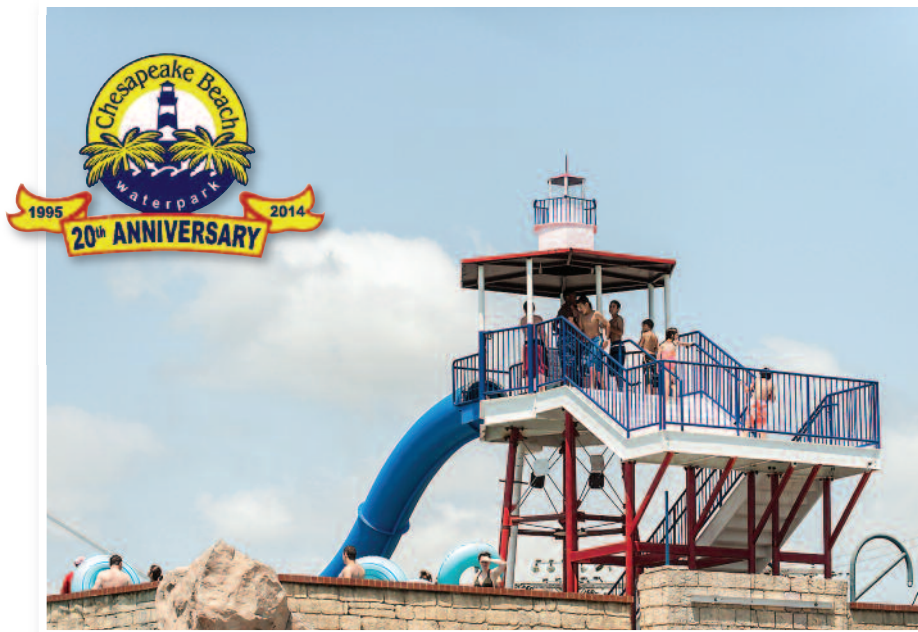
The 2014 season will be our 20th Anniversary at the Water Park. We are planning to make this the best season ever!