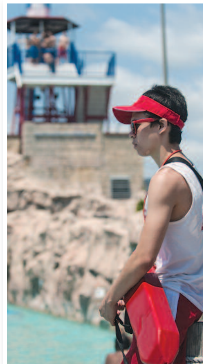
Summer employment at the Water Park can be very rewarding! Check out our website or Facebook page to get more details on when we are looking to hire.

UPCOMING IN THE 2014 SEASON: You have been talking, and we have been listening! We are developing a new program for the groups and summer camps to visit the park only on specified days and times. This will help to alleviate overcrowding of the Park and create a more