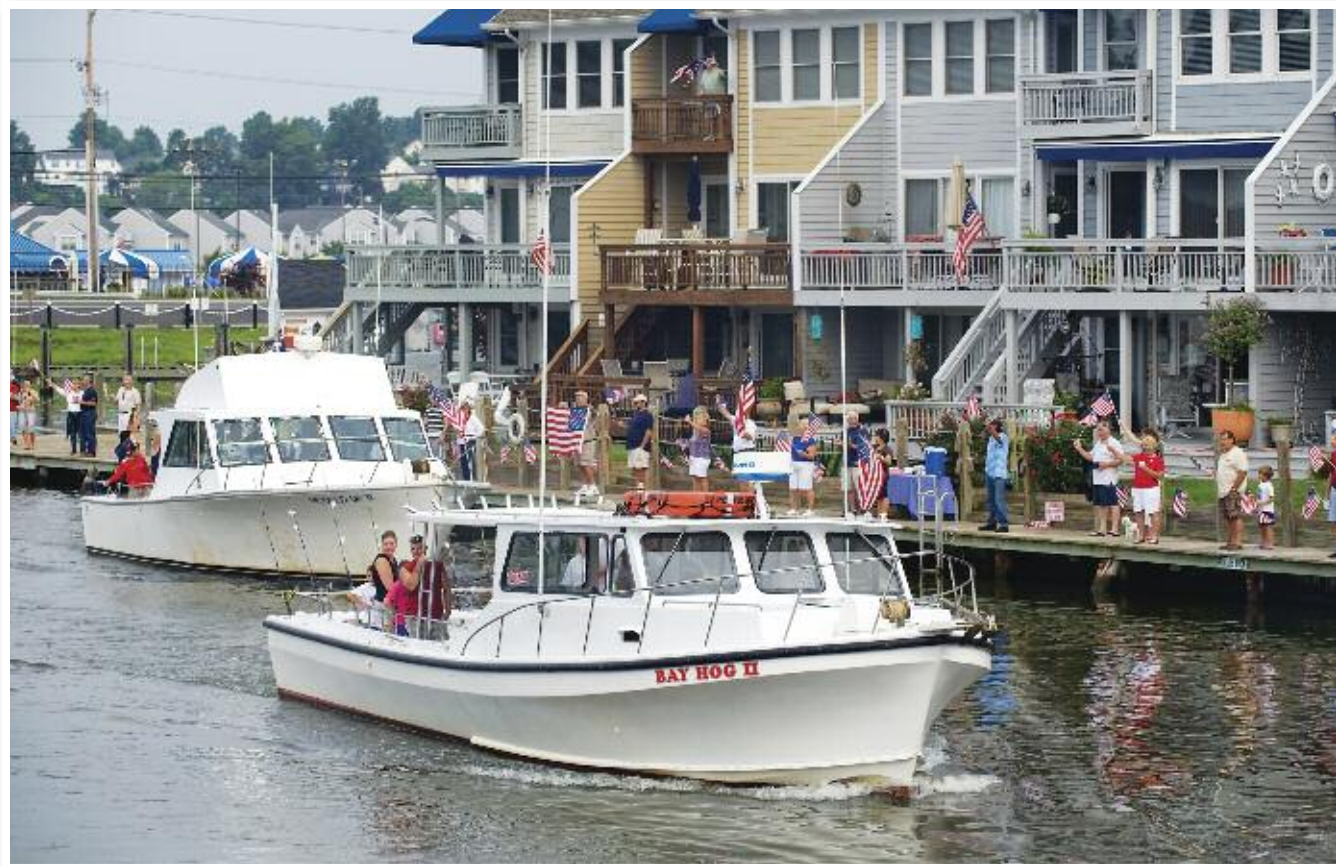
Residents give a wonderful salute and send-off to our Wounded Military and their families as they head out of Fishing Creek.