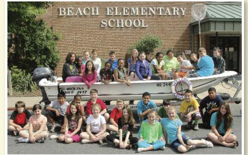
Fifth grade students at Beach Elementary participated in a contest to name the new boat.

At the April Town Council meeting, a resolution was passed to purchase a 17-foot Carolina Skiff for use on Fishing Creek. This boat will be used to monitor water quality, collect trash, inspect and maintain the trail, provide safety to educational field trips and deploy and recover oyster cages.