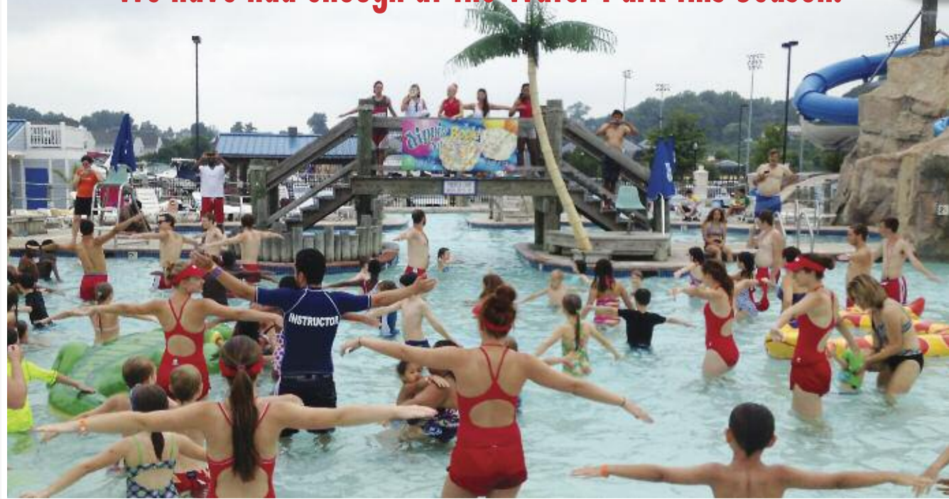
The Chesapeake Beach Water Park had 165 guests who participated in this year's World's Largest Swim Lesson!