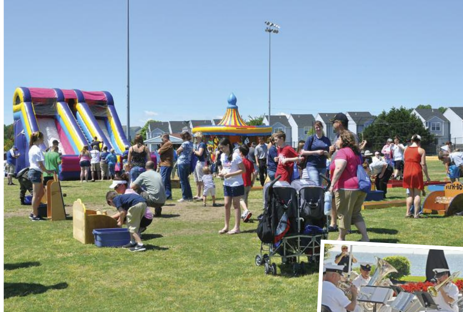
Educational and fun activities are planned for the Chesapeake Beach Stars and Stripes Festival!