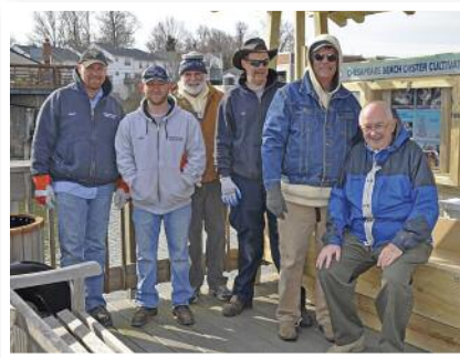
Volunteers clean the new Oysterquarium on a regular basis.