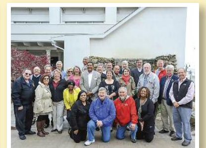
Members of the MML and the Chesapeake Beach Town Council.