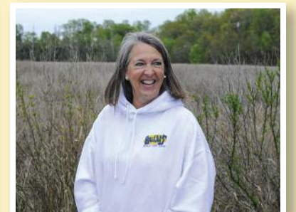
Rockville Mayor Bridget Donnell Newton on Chesapeake Beach Railway Trail.