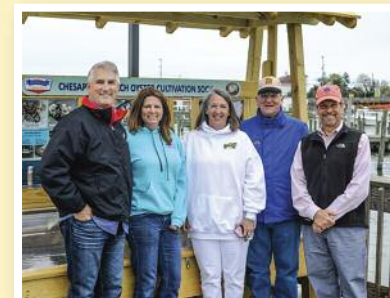
MML Board Members at the Oysterquarium.