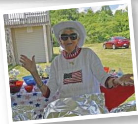
Stars and Stripes Festival, continued from page 1.

Playing the National Anthem as well as other patriotic music at the Opening Ceremony on Saturday, May 24 at 10:00 a.m. at the Chesapeake Beach Veterans' Memorial Park is The United States Naval Academy Band's Brass Quintet.