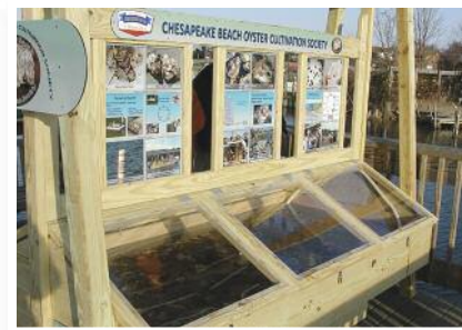
The Oysterquarium is located at the first rest stop along the Railway Trail.

The SMART Board class has been completed, and Amenda Brown, Ron Draper and John Bacon passed the final exam with flying colors! The project is now shifting into high gear with volunteers submitting the technical information to be used in creating all the modules. We are actively looking for information and volunteers with knowledge about tides, aquatic life, mammals, birds, insects, plants and grasses that thrive in