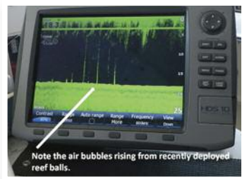
The depth finder shows bubbles emerging from the reef balls.