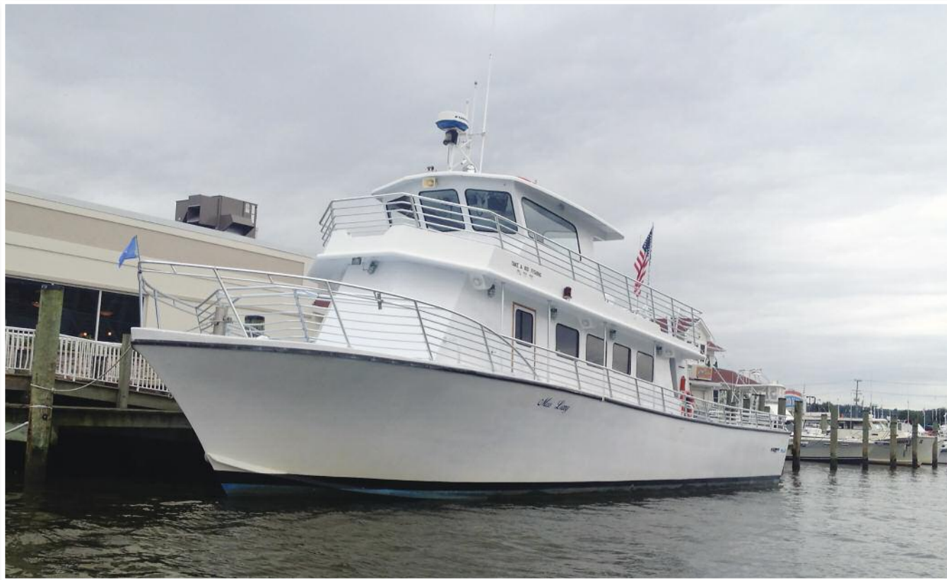
The "Miss Lizzy" is ready for moonlight summer cruises this summer. Reserve your spot onboard today!