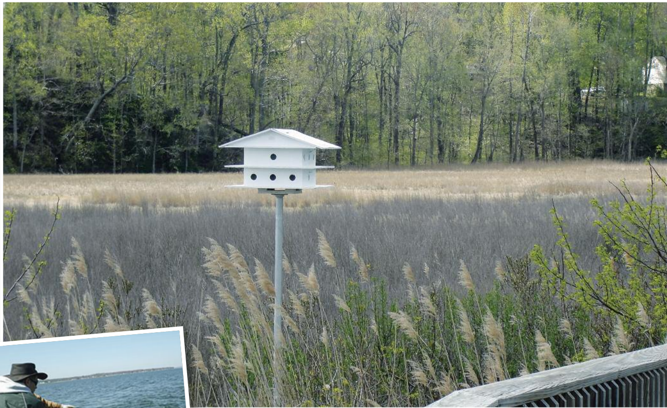
This birdhouse, located along the Railway Trail, is home to Purple Martins who love to catch insects and mosquitos.