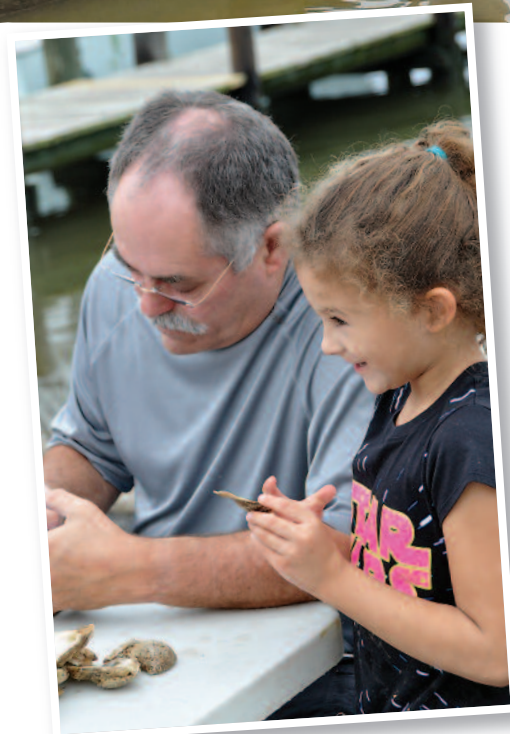
Counting oyster spat can be educational and fun.

To become involved in CBOCS go to the Town of Chesapeake Beach website and click on oysters. ■