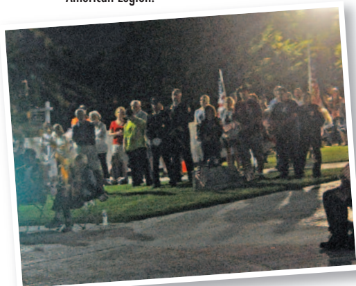
The Community came together in remembrance.