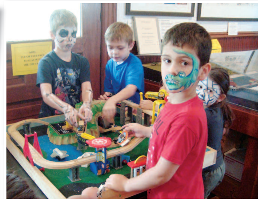
The grand finale children's program event included face painting and playtime at the Museum.