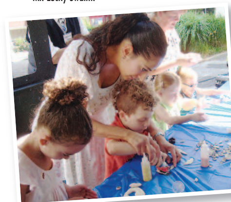
Guests making special crafts during the children's program—Adventures in Maryland.