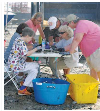
Volunteers count and record the oyster spat, information that is used to calculate survivability rates.