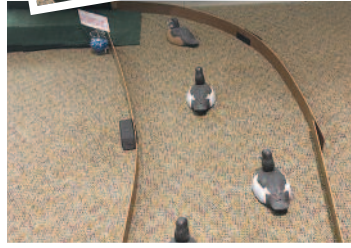
Visitors of the 9th Hole Event were treated to creative putt-putt golf holes while learning fun facts about our beautiful Town.