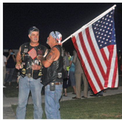
Members of the 'Nam Knights of America Motorcycle Club, Old Line Chapter.