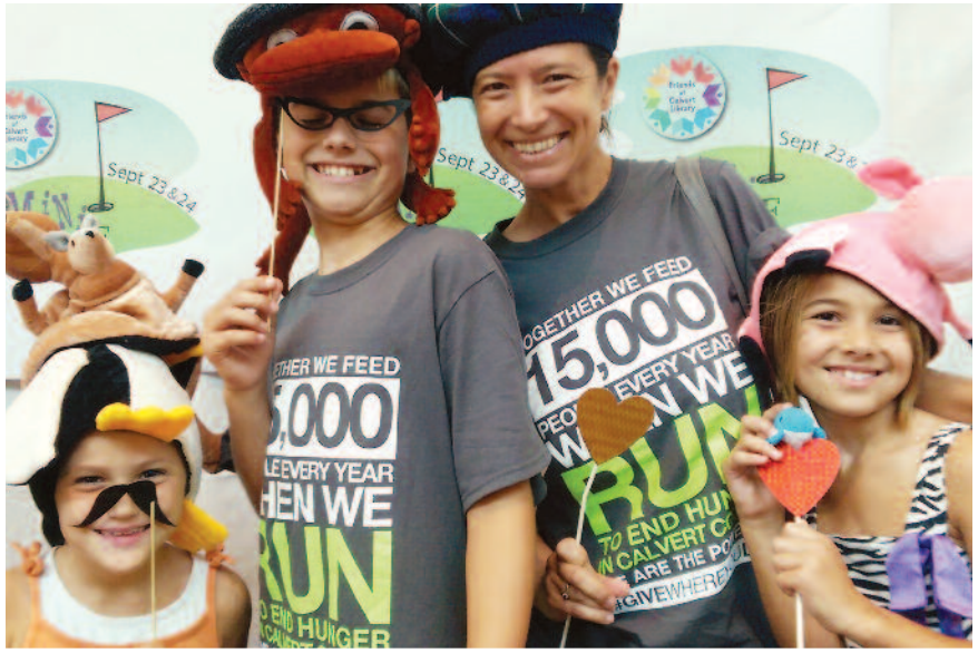
Proceeds from the 9th Hole fundraiser went to the Friends of Calvert Library organization.