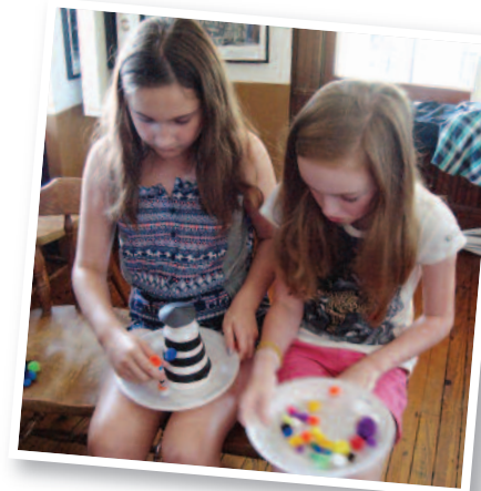
On the Bay summer program had guests building beautiful lighthouses.