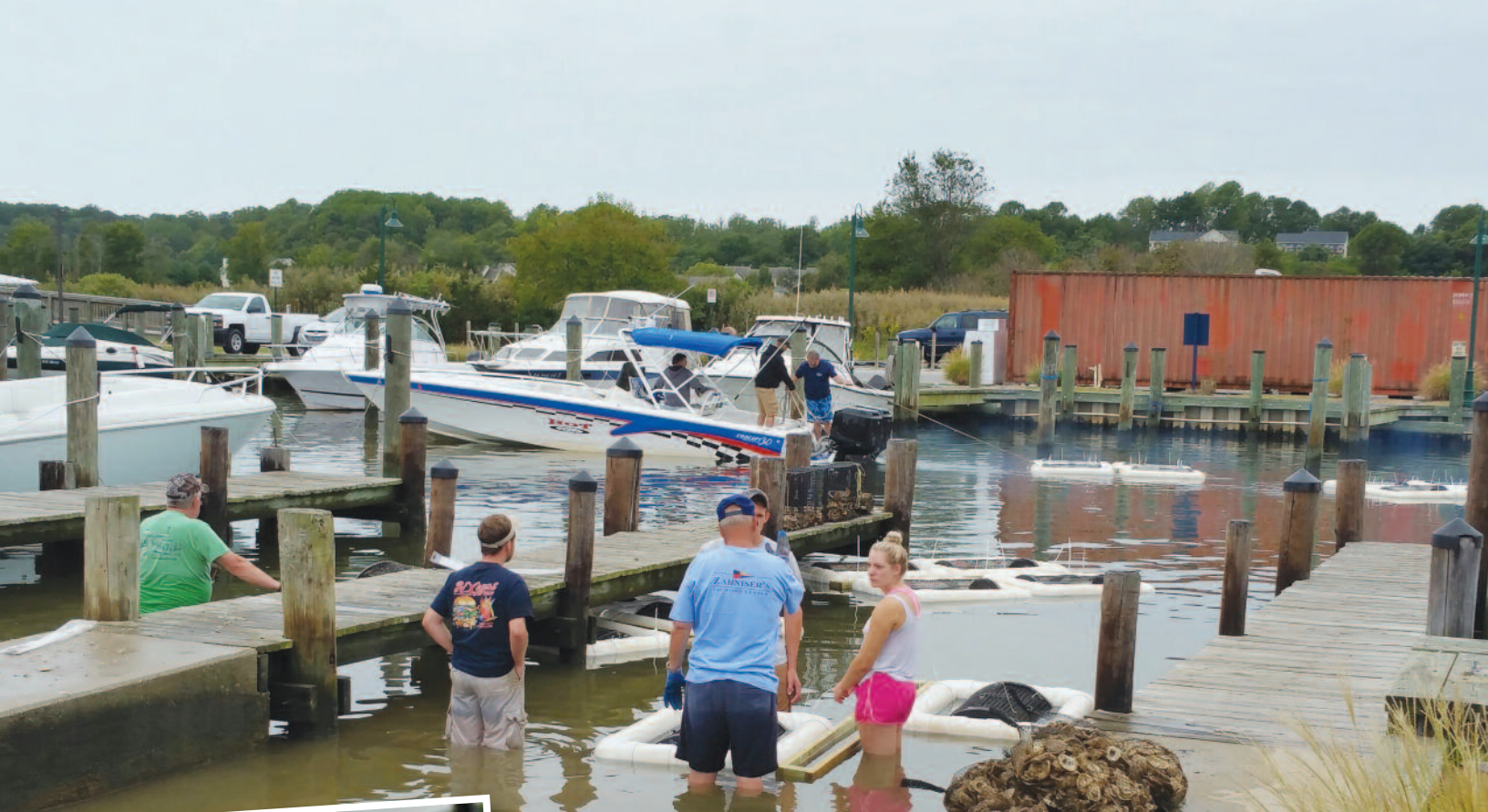
Volunteers transfer oysters from the hatchery to Fishing Creek.