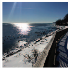
Boardwalk at 15th Street.