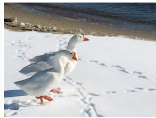
The Town geese enjoying the snow at the Bay's edge.