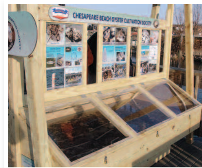
Visit the Oysterquarium at the first rest stop on the Trail from April to November to view the life cycle of an oyster.