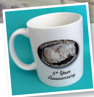
CBOCS's anniversary mug for its members.