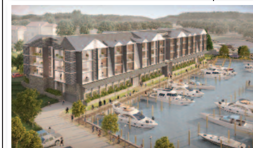
A rendering of the Harbor Vista South Apartments.

The image below is a rendering of the Harbor Vista South Apartments. This building will contain 58 luxury rental apartments with parking underneath. Tenants will have priority access to the Marina West slips.