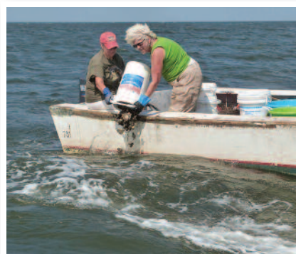
Volunteers transfer mature spat to the Old Rock Reef in the Chesapeake Bay.