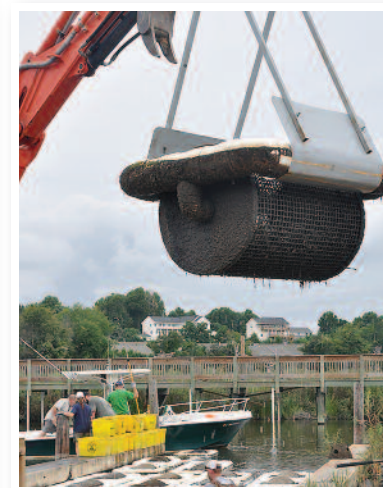
Removal of the oyster cages was made easier by this special lifting frame.

Chesapeake Beach Railway Trail enhancement has taken many forms in the last three years. Osprey platforms, purple