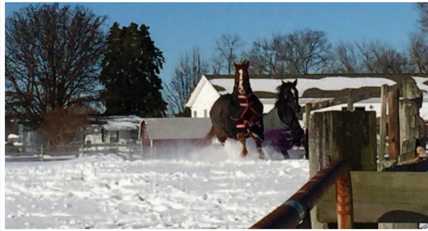
These beautiful horses enjoying a romp in the snow.

The snow curling off of the metal roof on the Brady home creates this fun swirl – almost like a surfing wave.