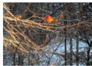
The sun on the cardinal and branches creates a fiery glow after the snow storm.