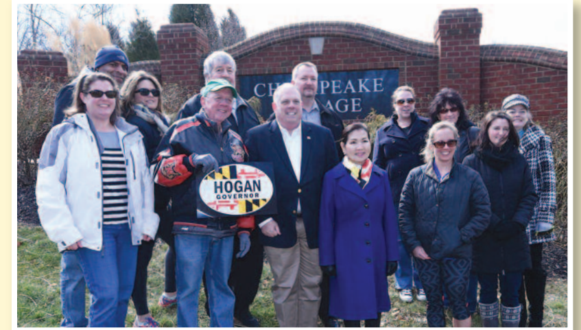
Maryland Governor Larry Hogan with residents outside of Chesapeake Village.