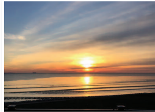
Sunrise waves frozen in place.