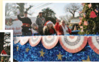
▲ Stars and Stripes Festival float