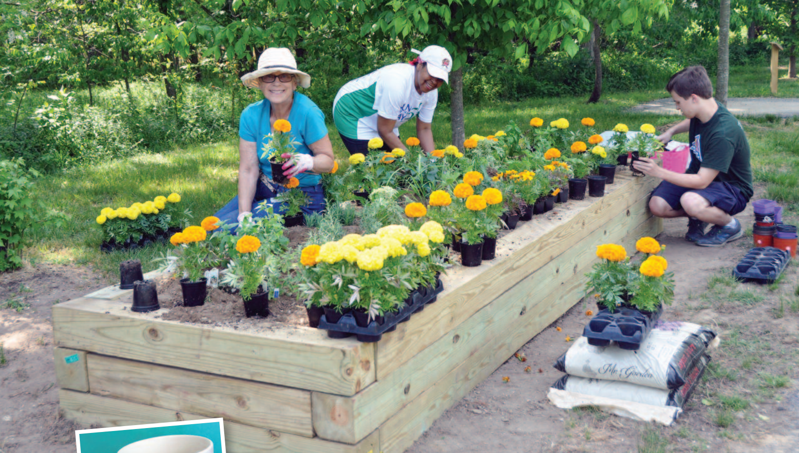
Volunteers help prepare the mosquito repellent plant garden along the Railway Trail.