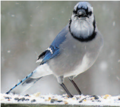
Blue jay on the Dawson deck.