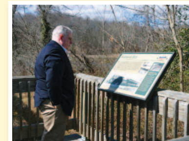
Hogan enjoys reading the informative signs along the Railway Trail.

Maryland Governor Larry Hogan visited Chesapeake Beach on Friday, February 26. He strolled along our beautiful Railway Trail, observing the CBOCS oyster cages and learning about our oyster recovery program. The governor also visited the area adjacent to Chesapeake Village where the Town hopes to build a sidewalk/boardwalk combination which would connect the secluded subdivision to the rest of Town. The Town is seeking State funding in the form of a grant to partially fund the project. ■