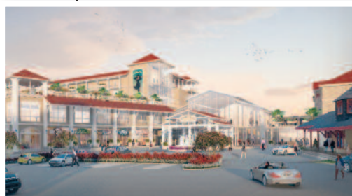
The proposed entrance to the resort complex.

Below is a rendering of the proposed entrance to the resort complex. Note the hotel and Railway Museum on the right. These are unchanged, but nearly everything else in this drawing is new. The complex will add retail space, a facility to host weddings year-round, conference space, more restaurant space, a