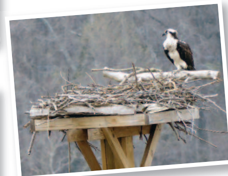
The osprey platforms are just one of the many enhancements along the Railway Trail.

martin house, and bat boxes attract birds and help to reduce the mosquito population. A flora guide with signs identifying all the trees and shrubs along the Trail helps visitors make decisions on future plantings around their homes. A mosquito repellent plant garden plus an associated brochure is available. Soon a pollinator garden and hotel along with a brochure will be installed to help restore the monarch butterfly population.