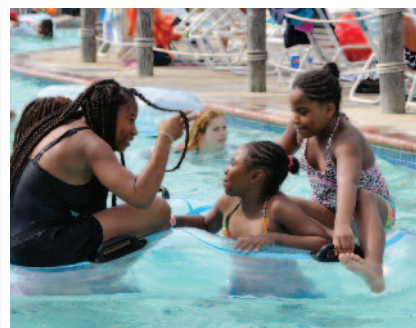
The Water Park is a safe, fun place for all to enjoy!

2016 Season Passes are now available for advance purchase on our website at www.chesapeakebeachwaterpark.com . Purchase your Season Passes before the Water Park opens for the season! All those who pre-purchase Season Passes can avoid the