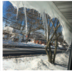
Odd icicles on Rt. 260 after the storm.