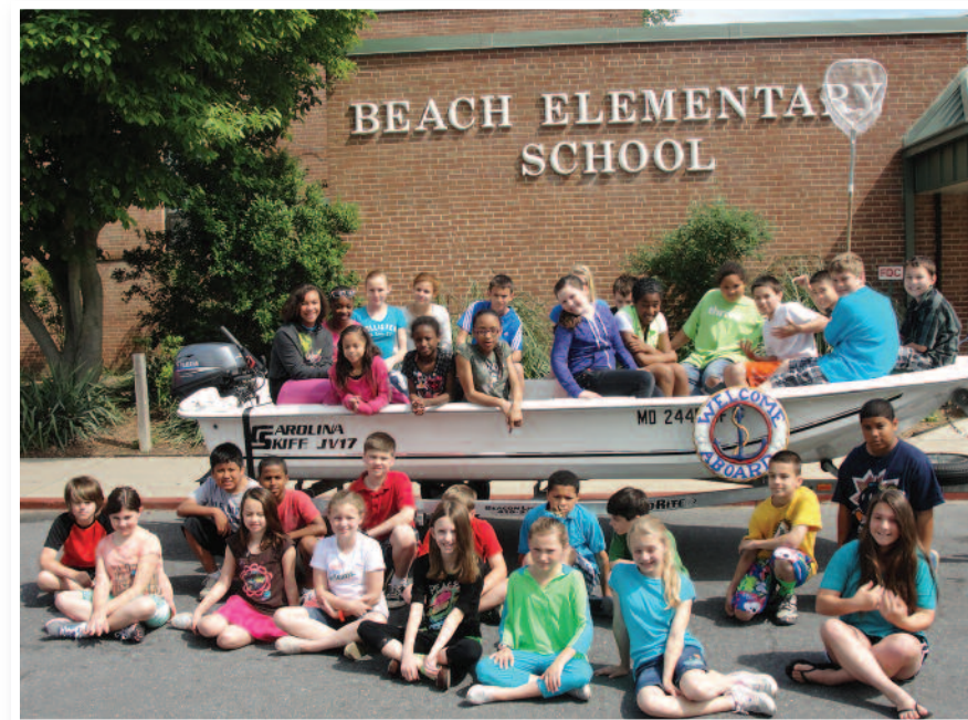
5th graders from Beach Elementary sent in suggestions to name the new CBOCS boat. The Bay Retriever has been put to good use over the last few years by CBOCS members.

Every year, 30 to 50 members gather to unload bags of oyster spat, load them into cages and move them under the Chesapeake Beach Railway Trail on Fishing Creek. A sample of spat is counted and recorded. After 11 months, those same volunteers come again to unload the cages and transfer the mature spat to the Old Rock Reef. The sample is again counted to determine the survivability rate. CBOCS has an above average rate of 70% plus, due to the protected, nutrient-loaded waters of Fishing Creek. To aid in