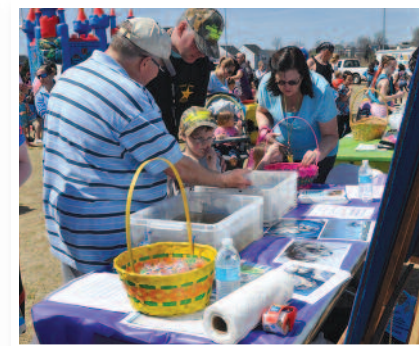
The CBOCS community outreach includes demonstrations at local events.