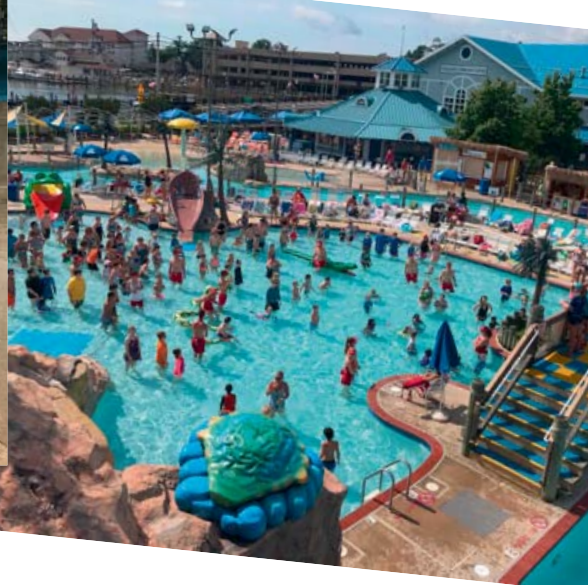
Participants (342), joined us from near and far to participate in the 2019 WLSL.

Programs & Special Events We kicked off the Season with the World's Largest Swim Lesson on June 20th. We joined an estimated 50,000+ swimmers from 32 Countries, on five continents around the World, in an effort to break another world record and promote awareness that Swimming Lessons Save Lives. Drowning is the second leading cause of unintended, injury-related death for U.S. children ages 1-14. Research shows risk of drowning can be reduced by 88 percent if children participate in formal swimming lessons between the ages of 1-4.