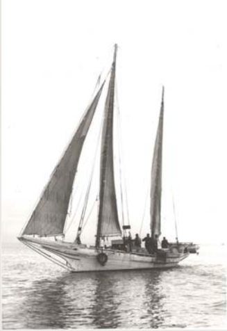
The Edna dredging for oysters

The Edna is the last of 600 bugeye sailing boats built in 1889 by John B. Harrison. It served as an oyster dredging boat until 1967. The Chesapeake Bay Maritime Museum acquired the Edna and completely restored it.