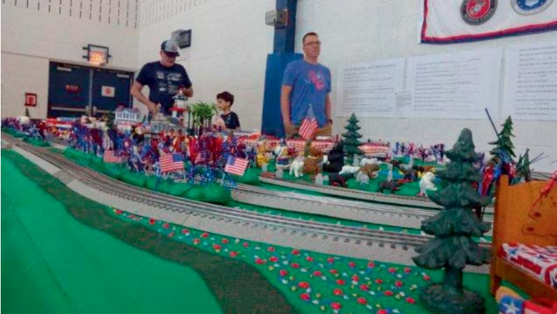
CBRM MODEL RR CLUB DISPLAY AT SPRING FAMILY FUN DAY.

CBRM's upcoming events include Fall Family Fun Day Sunday, October 13, 1PM – 4PM at the Northeast Community Center; Sweet Treat Express Saturday, November 16, 2PM – 3:30PM at the Northeast Community Center, and the Dramatic Reading of the Polar Express Friday, December 20, with two readings at 5:30PM and 7:00PM at the museum.