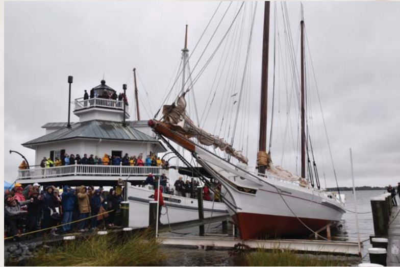
The Edna launching, 2018

Restoration of the Edna was a two-year project. It was sponsored by a grant from the National Park Service. Shipwrights restored the deck, sails, rigging and hull, finishing in Fall 2018. The hull is comprised of nine hand-carved pine logs. The Edna is 58 feet at the water line and 85 feet overall.