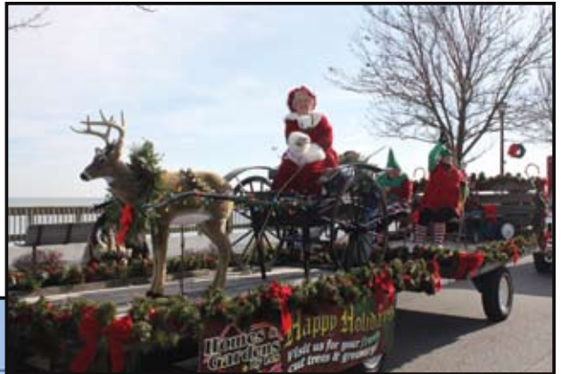
Mrs. Claus waves to the crowd as she rides along with her elves and reindeer.

CRAB!?!? In what has become a playful, delightful game in Chesapeake Beach during the holidays, we watched the migration of one of the crabs again this year. Each evening it was interesting to see what the crab was up to and where it would turn up. In two short years, this has become one of the most anticipated "games" of the season, and we can't wait to see what the crabs will have in store for us in 2011!