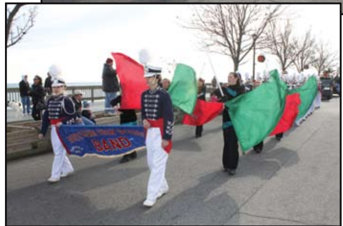
Northern High School Band