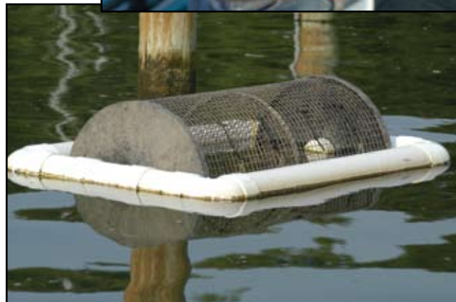
Oysters after a couple of years of growth.