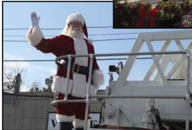
Santa Claus rode high atop the North Beach Volunteer Fire Department's Hook & Ladder!