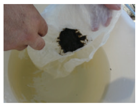
2.5 Million larvae