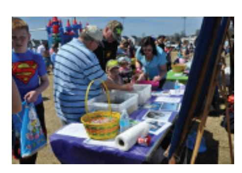
CBOCS at Easter festival