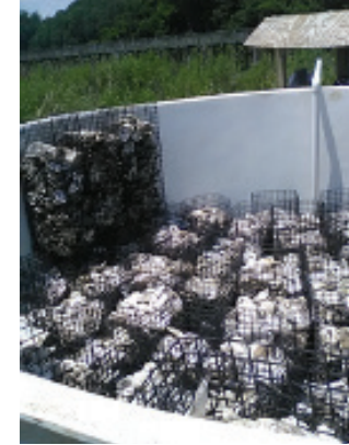
Cages in tank