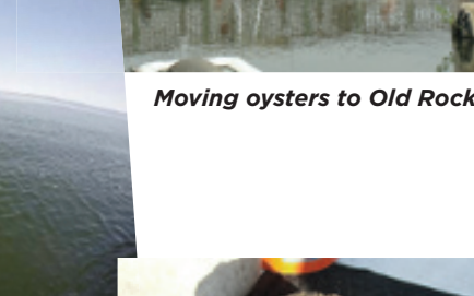
Reef ball 6 years in water

allowed limits. A special feature of Fishing Creek is the great marsh. The grasses and plants need Nitrates and Phosphorous to grow thus reducing pollutants flowing to the bay.