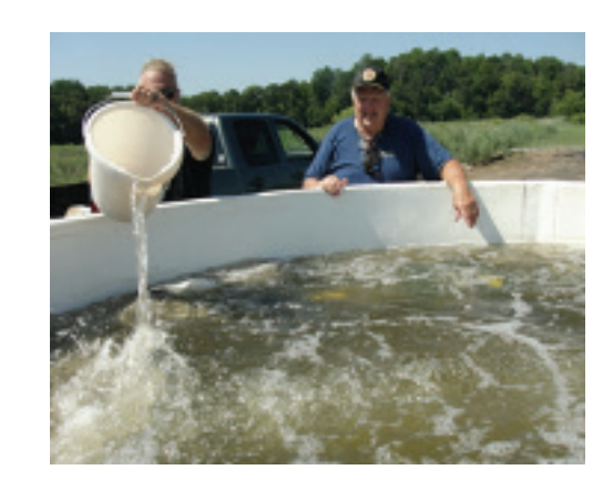
Spreading larvae on cages