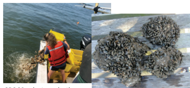
CBOCS volunteer planting oysters

(MGO) program sponsored by the Department of Natural Resources (DNR). The object was to start the replenishment of the Old Rock Reef with 1 year old oyster spat housed in protected cages in Fishing Creek. During the next 8 years CBOCS planted 860,000 oysters on the Old Rock Reef. A sample dredge in 2019 showed that our oysters are healthy and growing,.