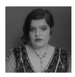
Escape Room Hortensia

teens to experts in the county in the arts and in various types of crafting. Librarians have been continually brainstorming ways to bring educational and entertaining programming to teens and tweens while also offering them invaluable ways to remain connected and social in a time of social distancing.