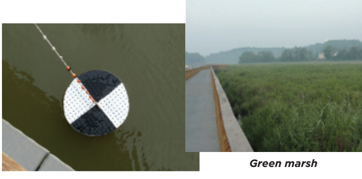
Testing for turbidity

CHESPAX and CBOCS education. The 5th grade oyster education program designed by CHESPAX is one of the best in the country. CBOCS is proud to facilitate the field trip which helps the students get hands on experience with oysters. These trips have reached more than 6500 students.