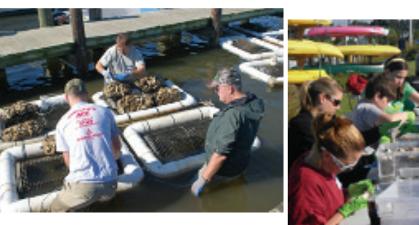
Loading spat in BOCS cages